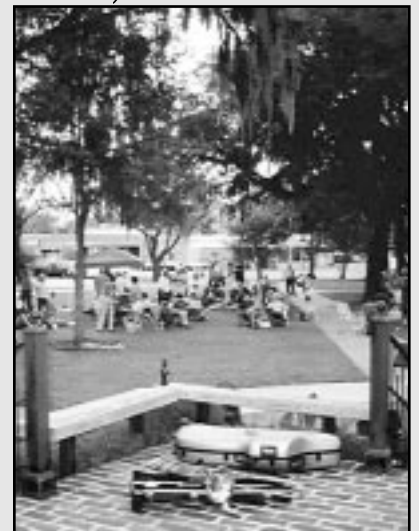
The Jazz Picnic held in Fletcher Park was a big success. A good time was had by young and old alike. Look for more concerts in the park to be held next spring.